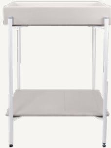
BOX BASIN STAND