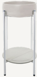
FUNL BASIN STAND