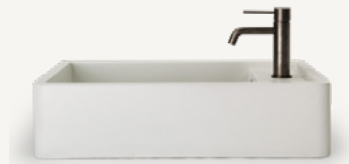
SHELF 02 BASIN