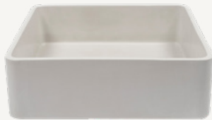
VESL SQUARE BASIN